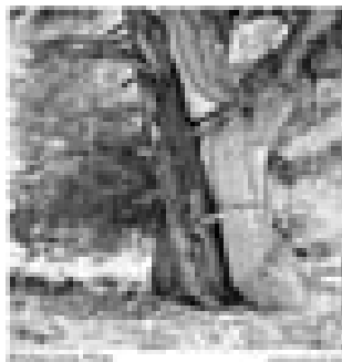
"Astrid Diehl is, "One of Germany's hardest working photographers."