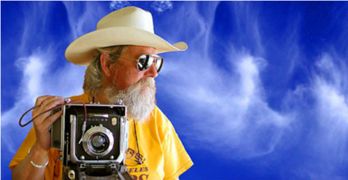
Self Portrait 2002