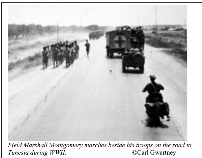
Field Marshall Montgomery marches beside his troops on the road to Tunisia during WWII.