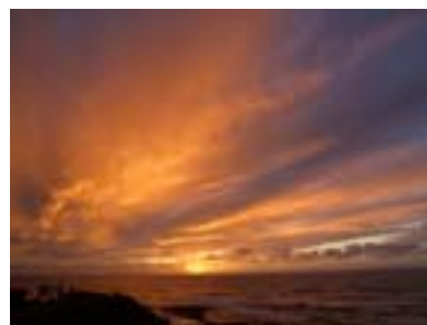
Fiery Sunset

For our loyal customers in Alaska, Hawaii, Canada and Mexico who ask, "What about us?," and for our customers in Europe, Africa, Australia, Asia, South America, here's what we can do: