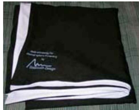
For another few bucks, have it weighted, tabbed with Velcro or embroidered with your name so it won't get lost!

Add $5 for Corner Weights or Velcro (we'll need your camera back dimensions) – If you want your name embroidered on Dark Cloth, add $5. Here's a peek: