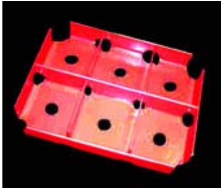
The Formulary Sheet Film Developer Tray works like a charm with 4x5 sheets in Pyno, or any other developer, for that matter.

by email or fax on or before March 1 st will pay $49.95 for each tray. After March 1 st the price on these trays will be $59.95, so order now and take advantage of this bargain. (Sorry, no dealers on this one!) Visit our online store >>