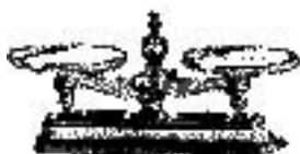
The Photographers' Formulary 19th Century Processes