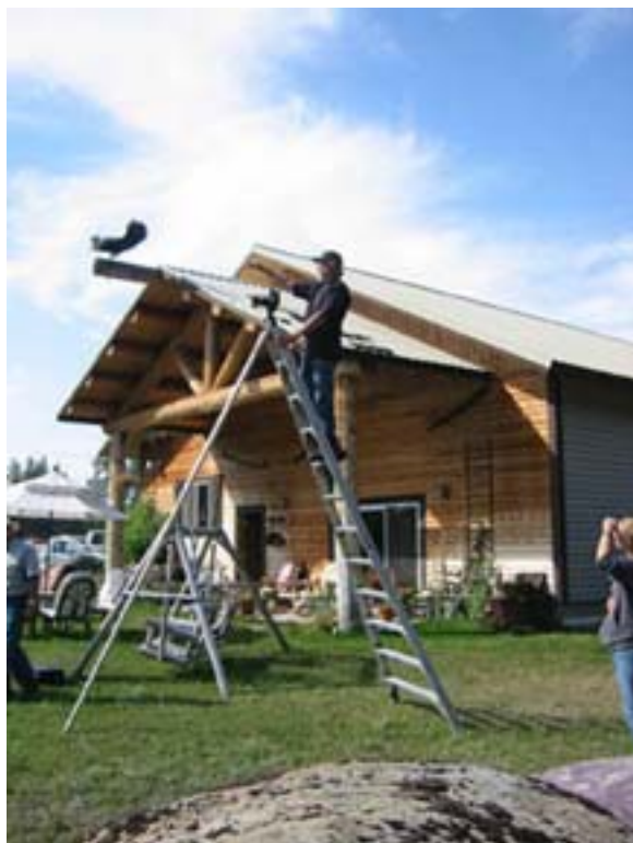
Bud points out the scenery from the top of Gordon's ladder tripod