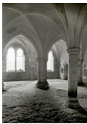
Lacock Abbey Arches

(no pun intended) to almost every stage in the history of photography.