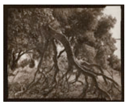
Ent - Van Dyke Brown