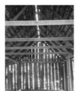
Old Barn ©Andrew Rogers