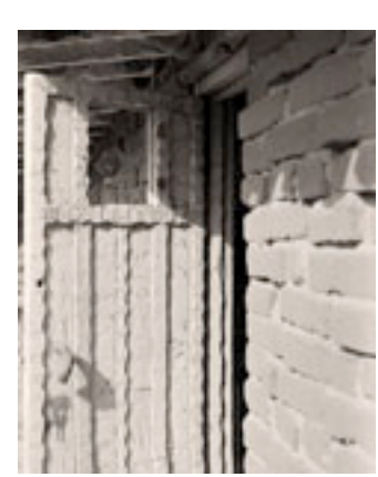
Coop Door - Sepia