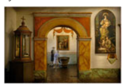
reVisions

presents the Mission San Juan Bautista reVisions show. A formal opening will be held during the Center's First Friday program on February 1, 2013 at 6 p.m. as the photographers talk about their work and experiences with the project.