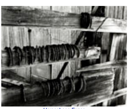
Horseshoes Fence