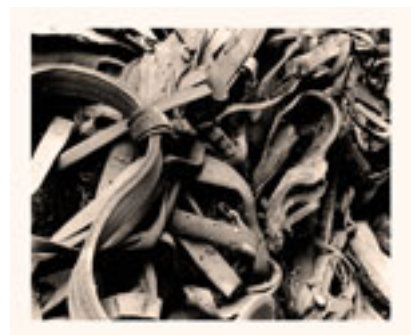
Decaying Tack - Sepia ©Andrew Rogers