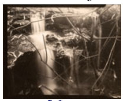
Iny Stream Van Dyke Brown