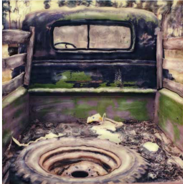
“Chevy Truck Bed”

· How to quickly set, compose, & focus a view camera ·