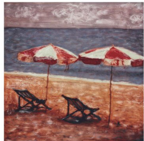
"Beach Umbrellas, Thailand"

The class is structured to give students hands on detailed step-by-step experience of the process, during which each student completes a few plates.