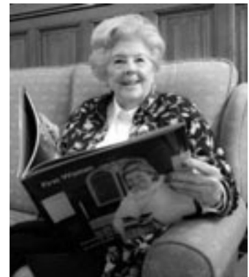
Baroness Betty Boothroyd February 2012

That didn't happen. The ladies had to get their clubs from their lockers in the clubhouse and make some last minute adjustments to