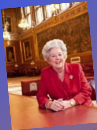
Baroness Betty Boothroyd, First Woman Speaker of the House of Commons April 2010