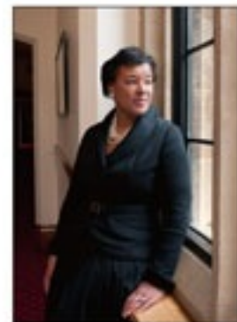
Patricia Janet Scotland Baroness Scotland of Asthal First Woman to be Attorney General July 2011 (NPG)