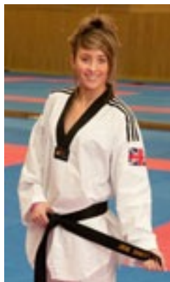
Jade Jones First Woman to win a gold medal at the Inaugural Youth Olympics in Singapore, December 2011