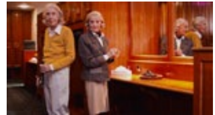
Golfing Sisters in the Ladies' Locker Room, Royal Mid-Surrey, April 2010 (Art of Photography Show 2013)

Corbin recently visited San Diego, California where she exhibited her photograph, "Golfing Sisters." As one of 200 entries selected for "The Art of Photography" show, out of more than 13,000 submissions worldwide,