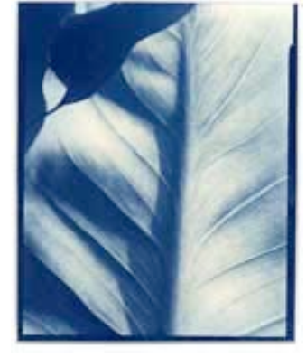
"Nature's Blueprint" 2010 Second Place