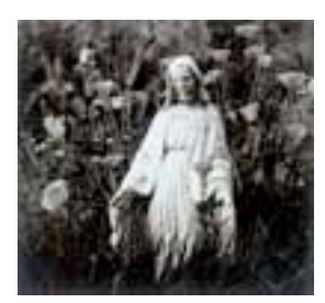
Full of Grace

tural events to the Friday Night Art Walk and opens its exhibit rooms to the public.