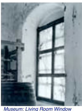
Museum: Living Room Window

For December's Art Walk the Center featured performances by musical groups from nearby Hartnell College. The Hartnell Symphony performed music with a holiday